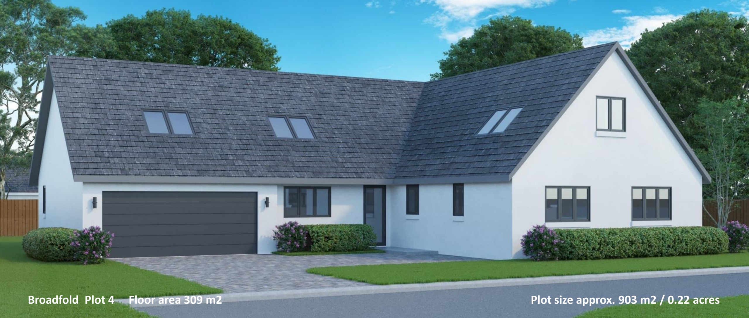
Broadfold Plot 4 Floor area 309 m2